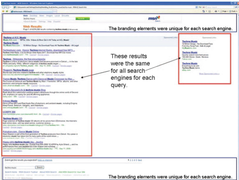
Fig. 2. Example of an experiment results page. (Source: [13], p. 1577)

After analyzing the gathered data, the researchers identified two phenomena: (1) the brand perception affects the search engine’s performance evaluation, even when the displayed results are not different; (2) the brand and its associated qualities change how the users analyze the results, affecting the number of viewed links, as well as the number of clicked items.